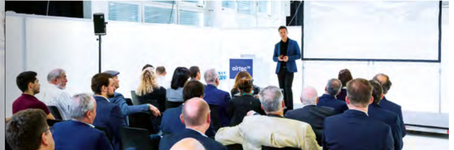
AIRTEC Conference, 2019