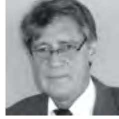
Helmut Brandl Modell und Formenbau Landesverband Bayern