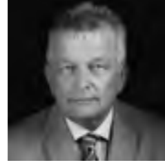
Bill Holler Industrio GmbH