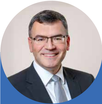
State Minister Dr. Florian Herrmann, MdL Head of the Bavarian State Chancellery, at Airtec 2022